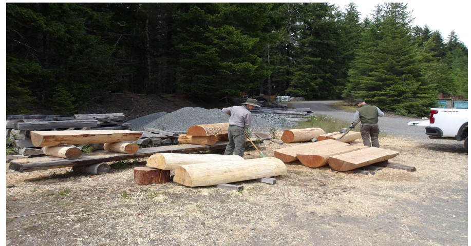
Material gathering and processing at Kautz Bone Yard